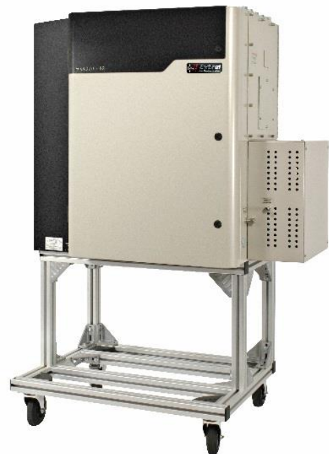
Figure 2. The MAX300-AIR, real-time mass spectrometer, configured for benzene fenceline monitoring

Air is pulled continuously from each sample point to the MAX300 for analysis and the benzene concentration is reported to the refinery's data system in seconds. There is no need for personnel to manually collect passive diffusion tubes, and no risk of contaminating samples during handling and transport. Purchasing thermal desorption GC-MS systems, or paying for third-party laboratory analyses, is unnecessary.